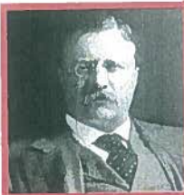
Theodore "Teddy" Roosevelt 1858–1919

Fun Fact: Thomas Jefferson was the first president to shake hands instead of bow!