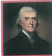
Thomas Jefferson 1743–1826

The 3rd president of the United States and the main author of the Declaration of Independence (1776). During his presidency, he made the Louisiana Purchase (1803), which doubled the size of the United States and gave us great states like Montana, Kansas, and Arkansas!