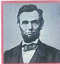
Abraham Lincoln 1809–1865

Fun Fact: Washington had all his teeth pulled when he was 57. Afterward, he wore ivory false teeth.