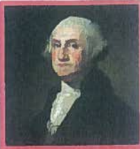
George Washington 1732–1799

The first president of the United States and the leader of the Continental Army in the American Revolution.